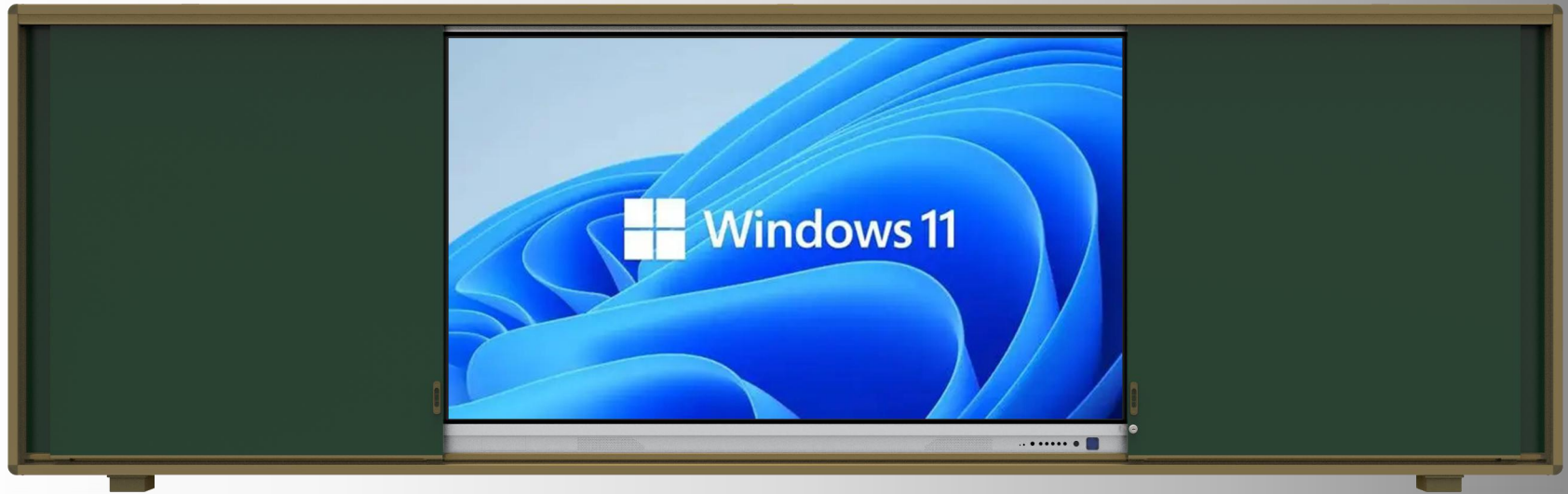
Open & Closed