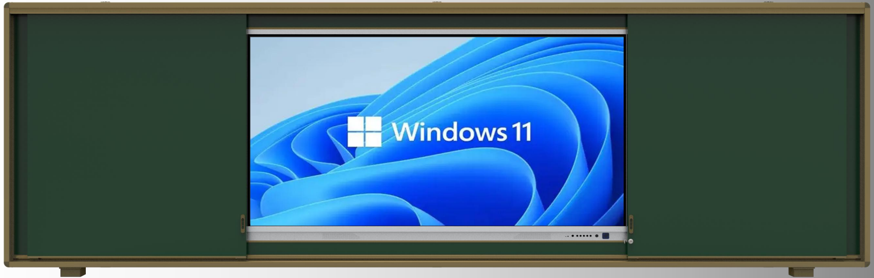
Open & Closed